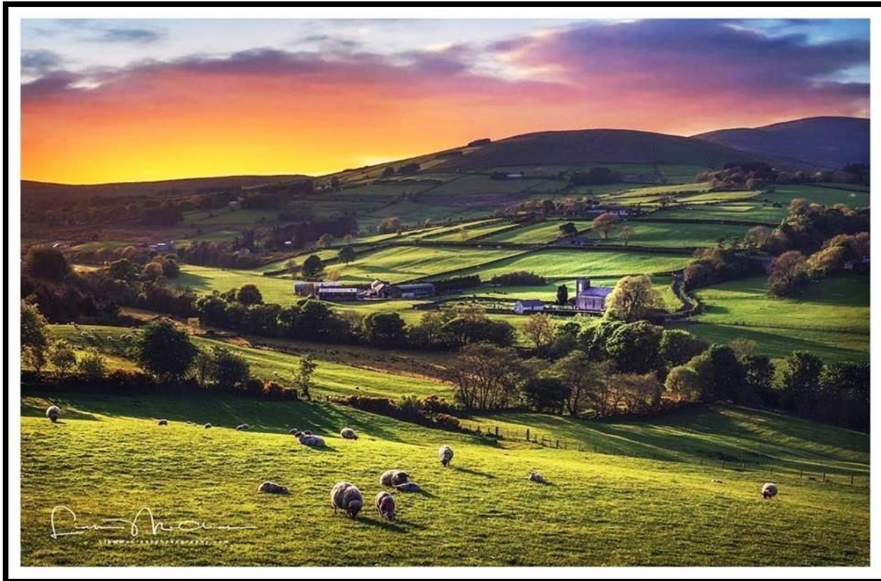
Photo of County Tyrone from the Web