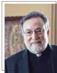
+Jaime Soto Bishop of Sacramento

This year more than 362,000 lives have been touched by your generous support of the Annual Catholic Appeal. Nearly $3.9 million has been pledged by more than 22,000 Catholic households.