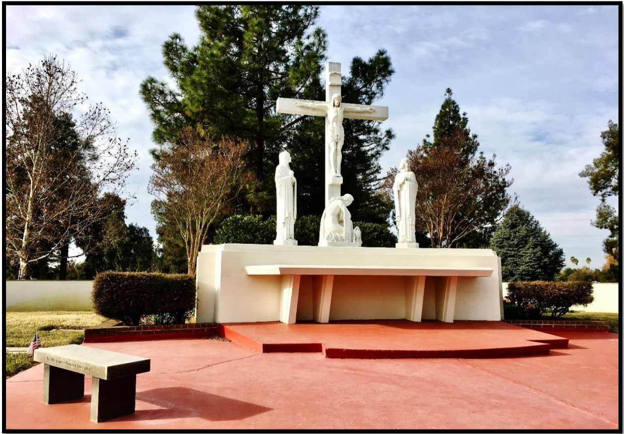
Crucifixion Scene next to the Priests' Section at Calvary Cemetery, Citrus Heights