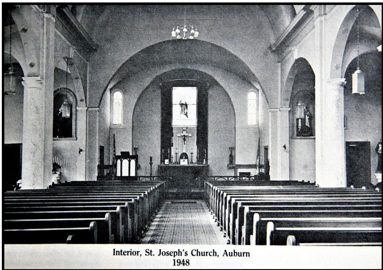
Interior, St. Joseph's Church, Auburn 1948