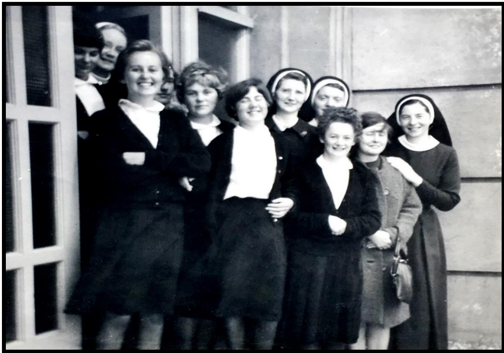
The Young Mercy Sisters of Auburn