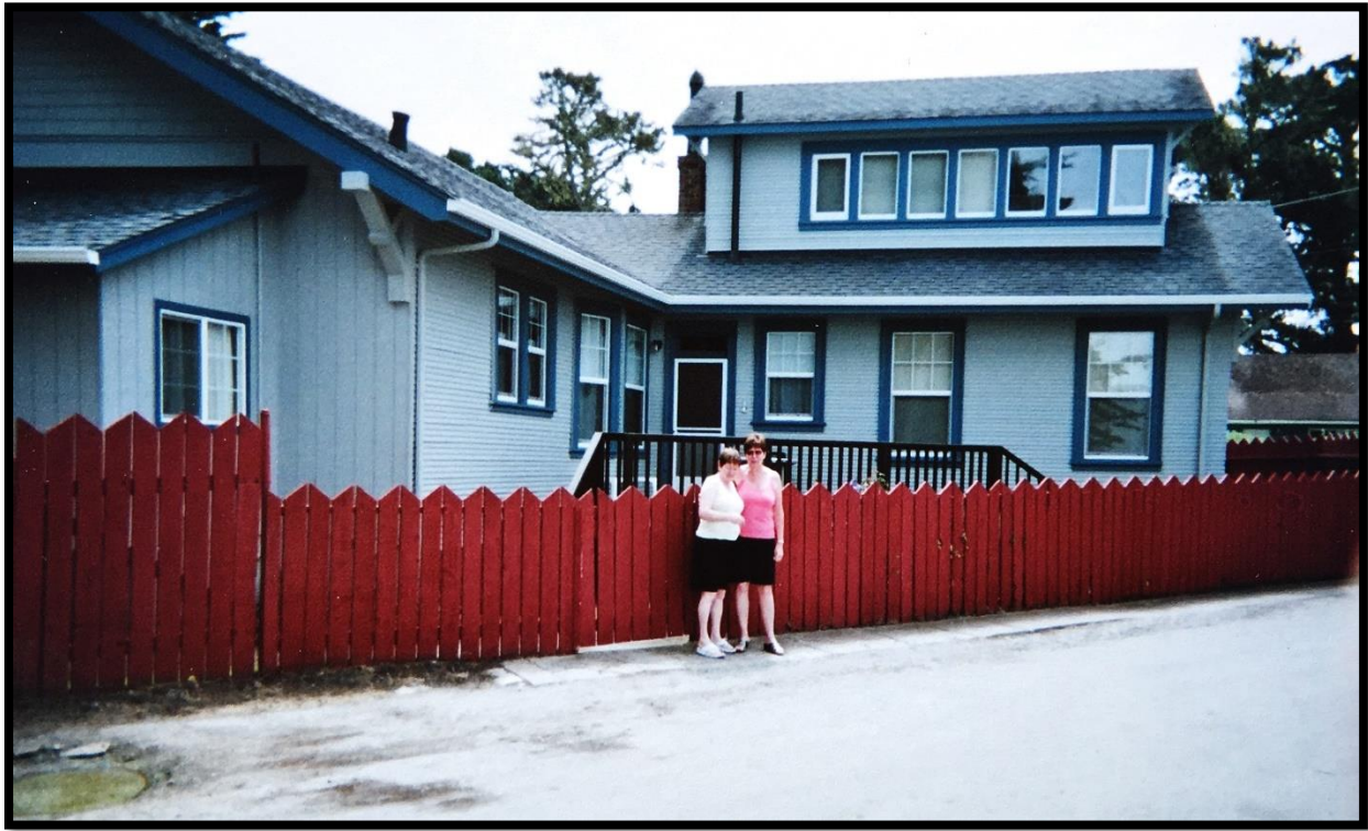
Mercy Sisters' Vacation House at Moss Beach