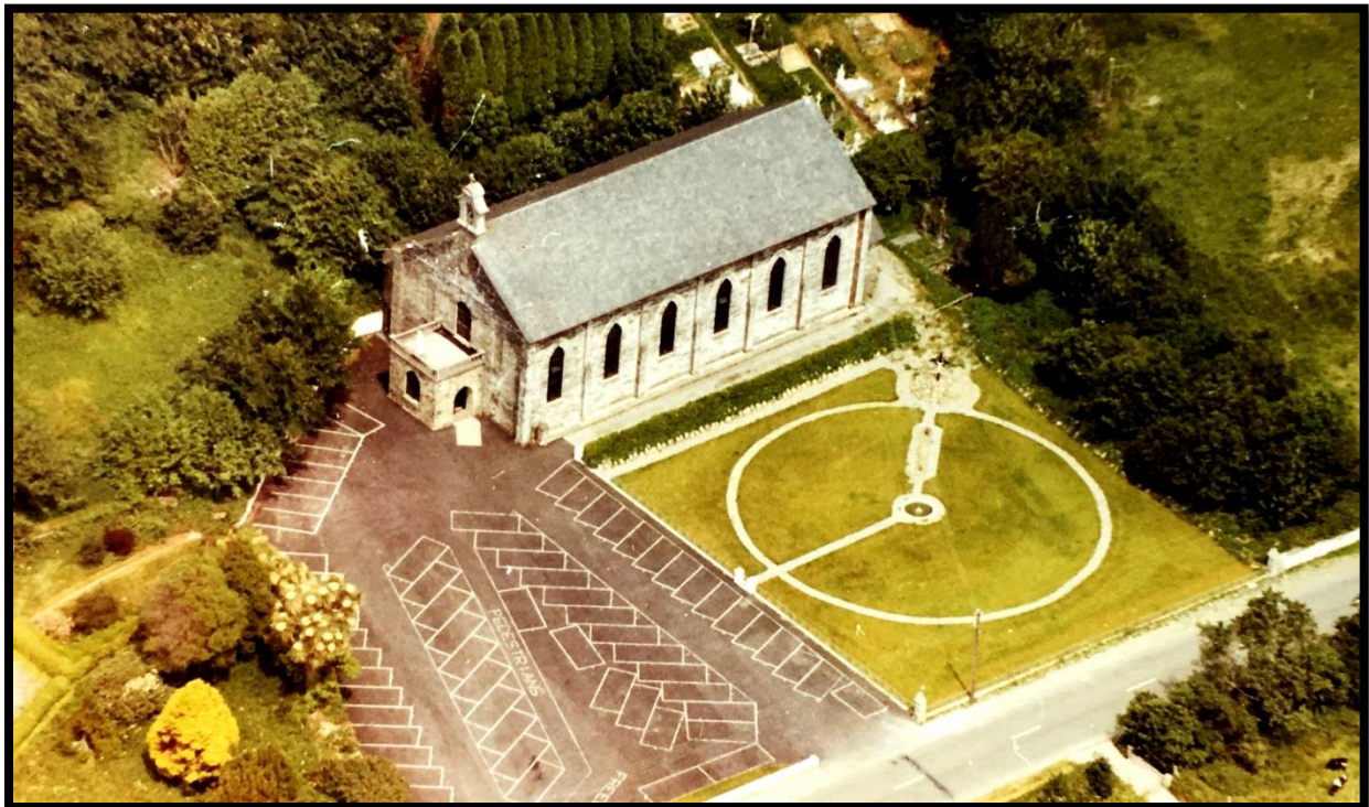
The Family Parish Church in Ireland