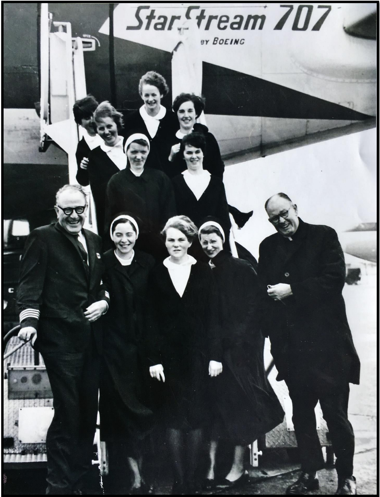
Leaving on a Jet Plane on Their Way to California