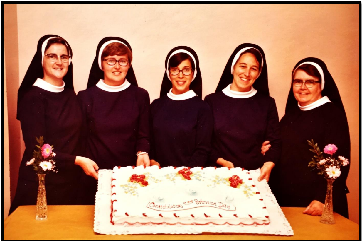
Profession Day Celebration