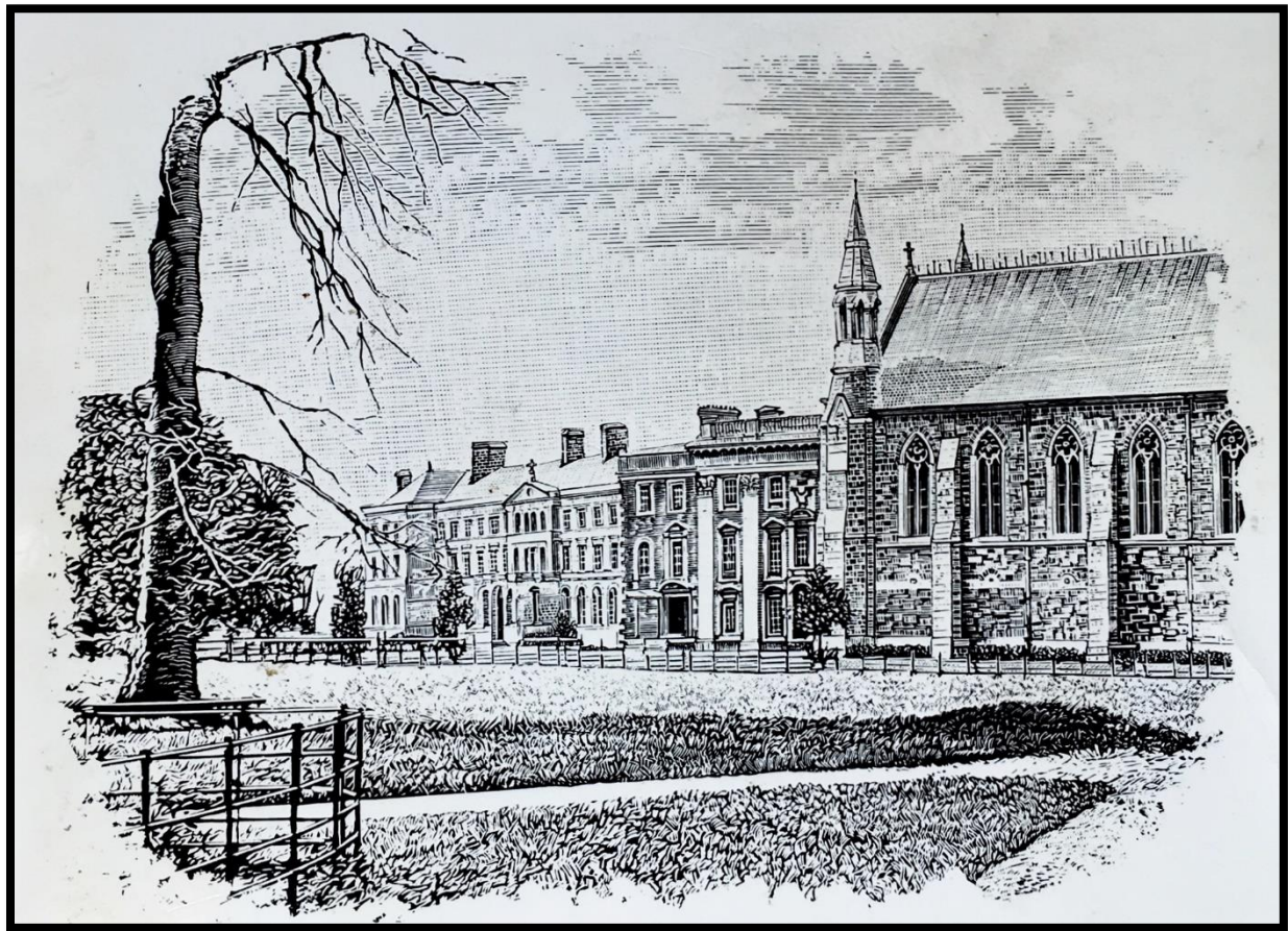
All Hallows College, Dublin, Ireland