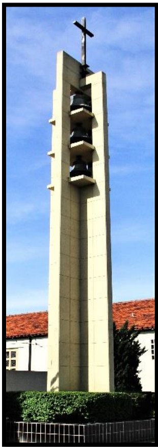
The Church Bell Tower

In 1952, when the parish building plans were being created, an area was set aside for a future bell tower. By 1961, Monsignor Twomey and the architects began designing the tower which was to hold 2¼ tons of bronze bells 49 feet above the ground.