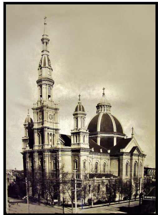
Cathedral of the Blessed Sacrament