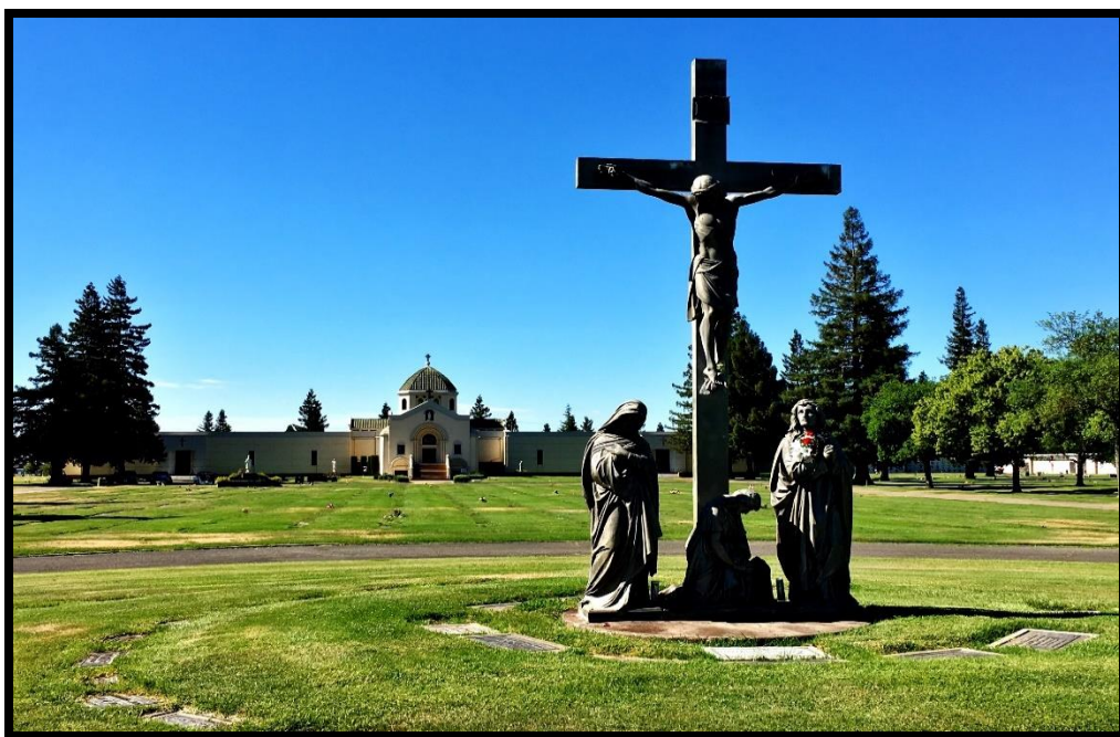
Priests' Section, Saint Mary Cemetery, Sacramento