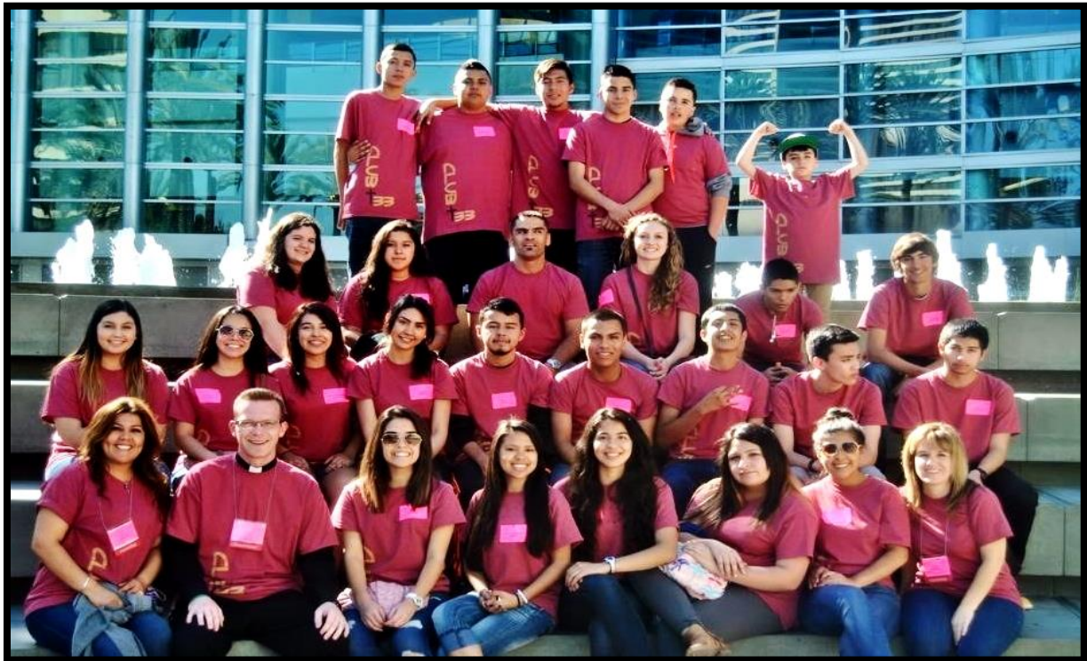
Winter's Parish Youth Group attend the LA Religious Education Congress, spring 2015