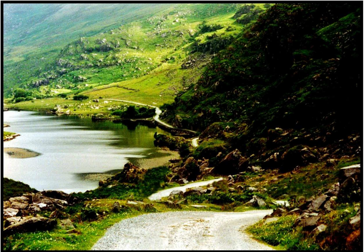
The Hills of Kerry, Ireland