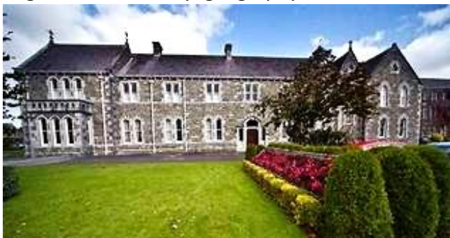
Saint Brendan's College, Killarney