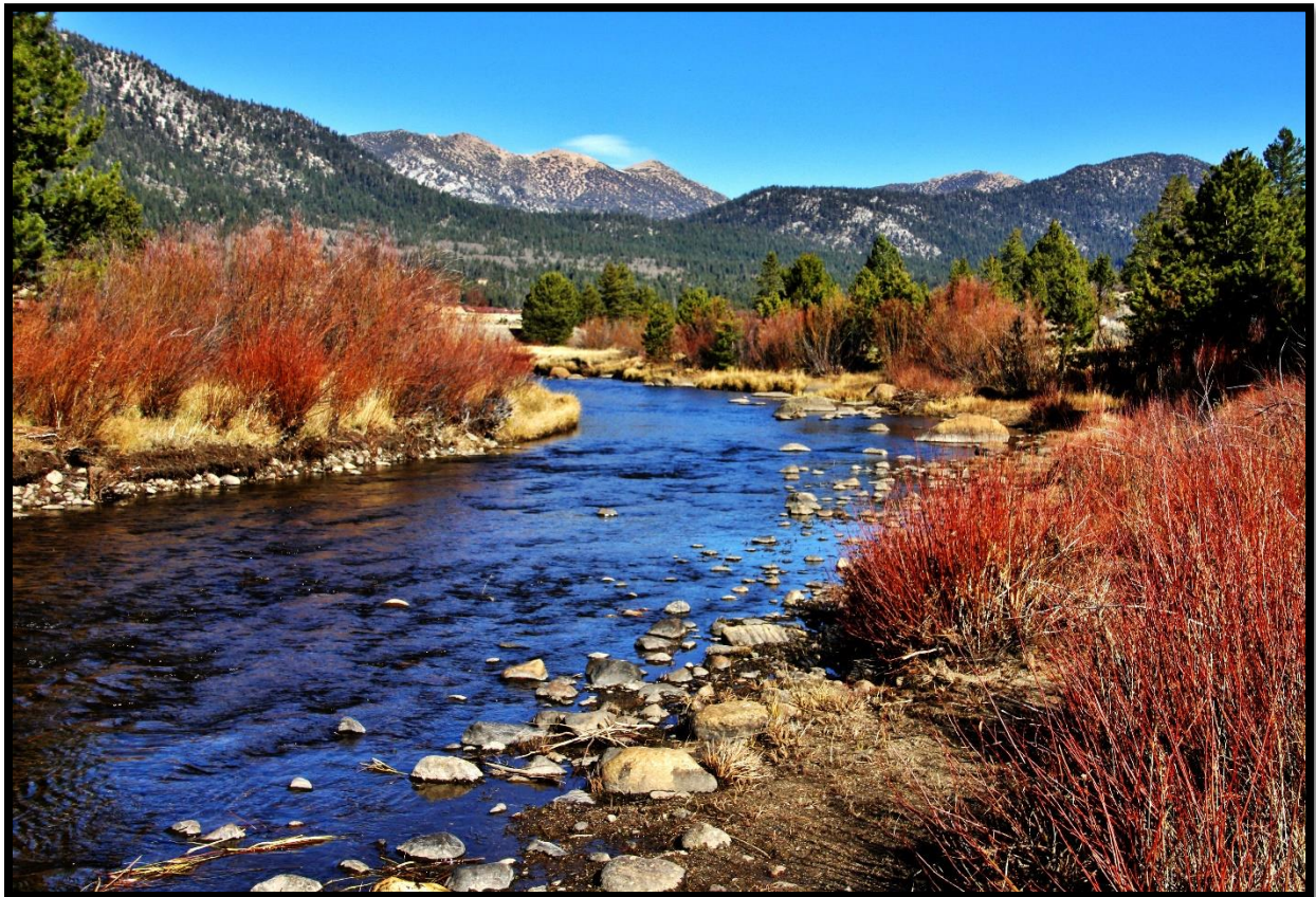
Hope Valley, California