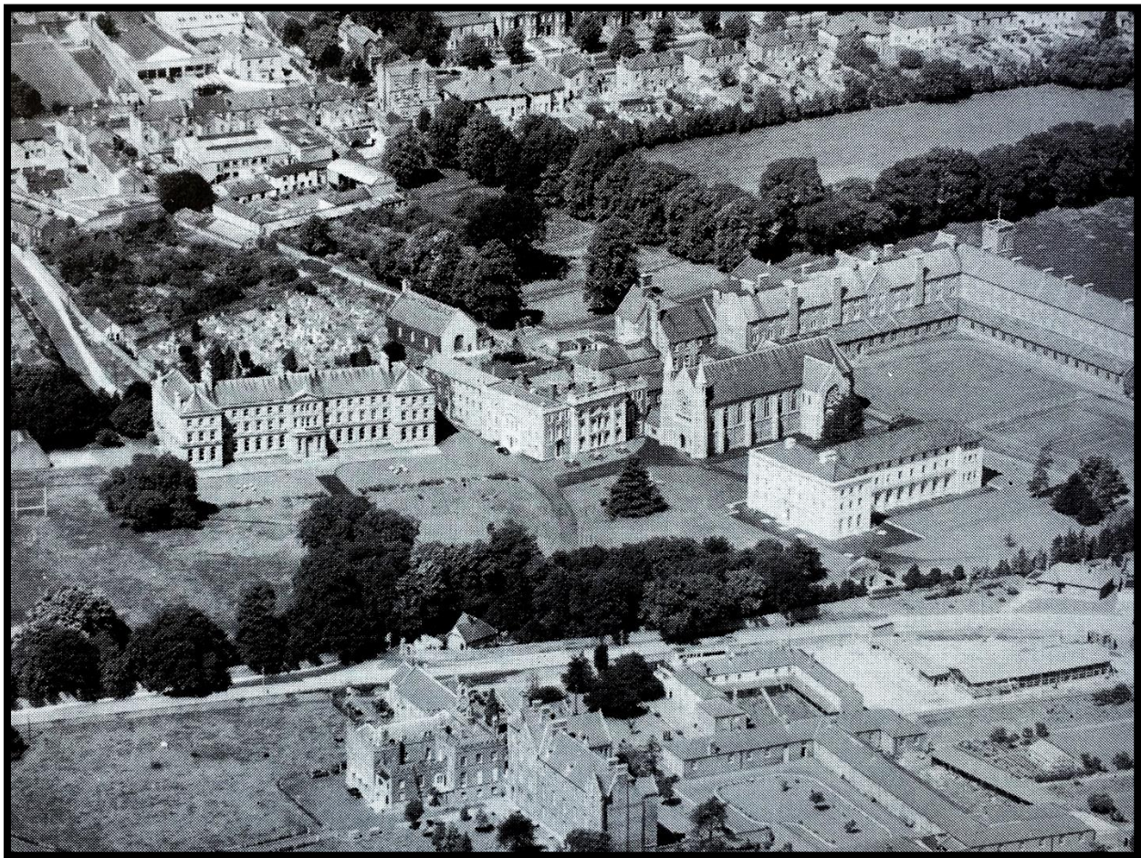
Photo from the book The Missionary College of All Hallows 1848 – 1891