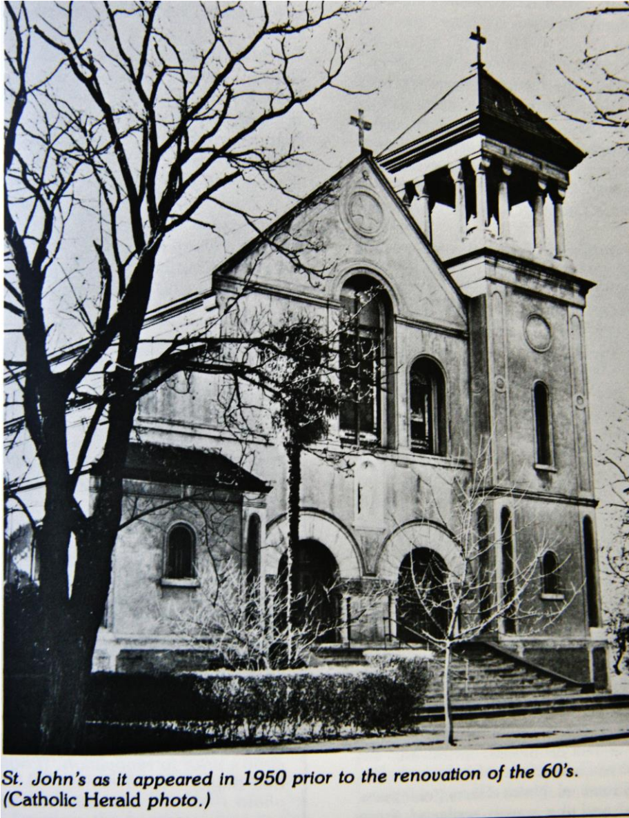
St. John's as it appeared in 1950 prior to the renovation of the 60's.

He was appointed pastor of Saint John the Baptist Church, Chico in 1951 before coming to Sacred Heart Church, Sacramento in 1958.