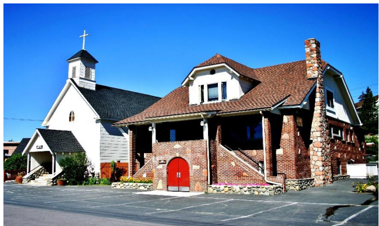
Assumption Church, Truckee