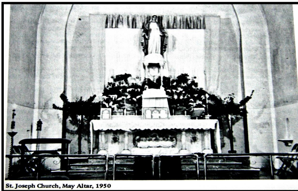
St. Joseph Church, May Altar, 1950