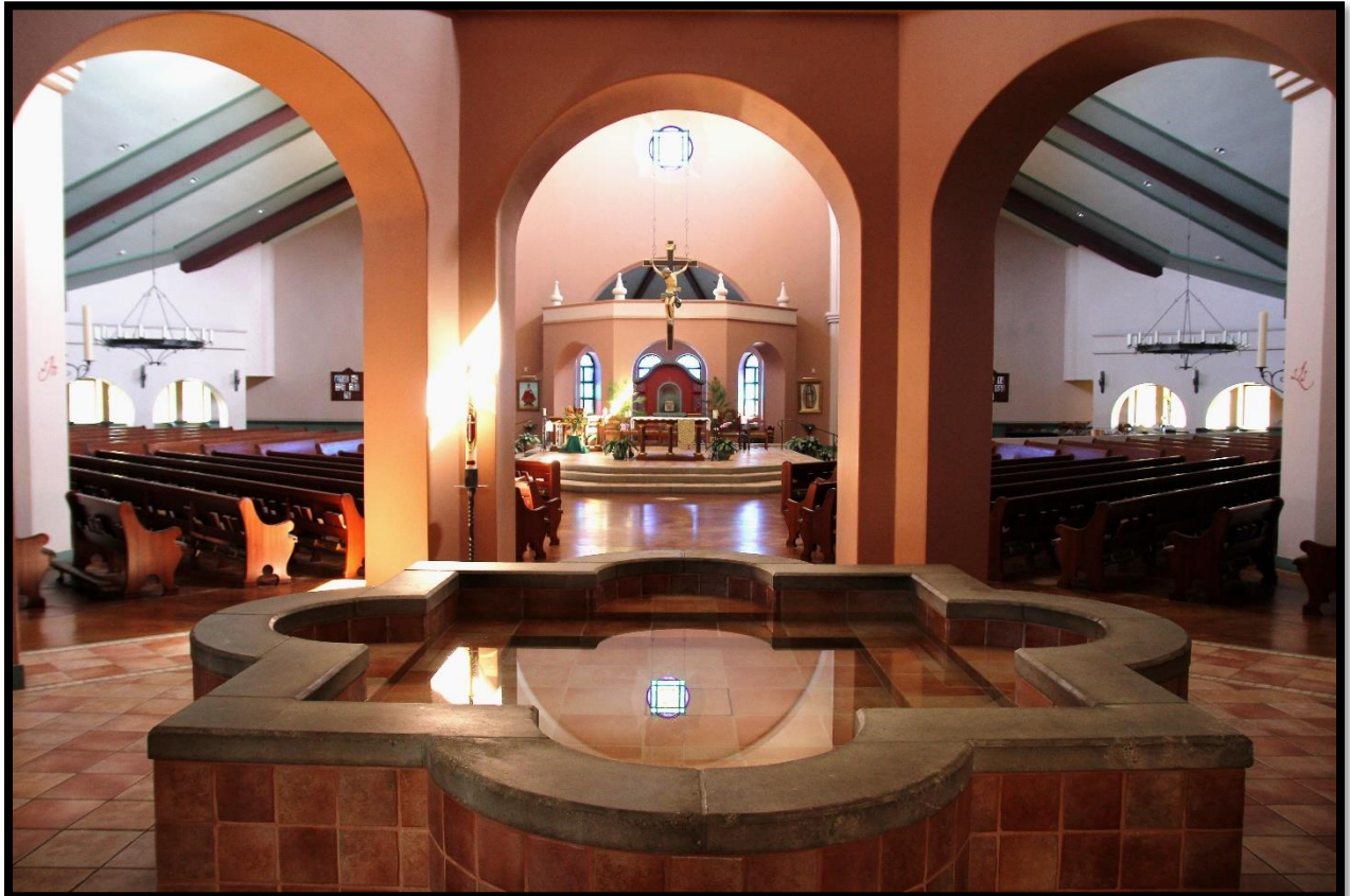
Saint Clare Parish, Roseville