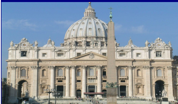
St. Peter's Basilica, Rome

The Catholic Church was founded by Jesus Christ when he said to Peter: "You are Peter, and upon this rock I will build my Church" (Matthew 16:18). Normally, most people become Catholic through what's called the "Baptismal Catechumenate," or The Rite of Christian Initiation of Adults—RCIA for short.