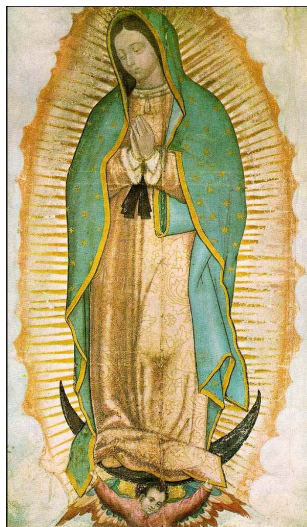
Our Lady of Guadalupe Patroness of the Diocese of Sacramento

If you were baptized in another church you may be received into the Catholic Church at any time, although some instruction should be expected. The amount of instruction will depend on how active you’ve been and your knowledge of the Catholic faith. Talk to the pastor or director of RCIA for more information.