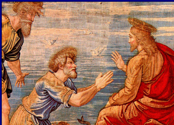
The calling of St. Peter

RCIA is not a program, but a gradual process in which one who, after coming to know Christ freely chooses to follow him by entering the life of faith in the Holy Catholic Church.