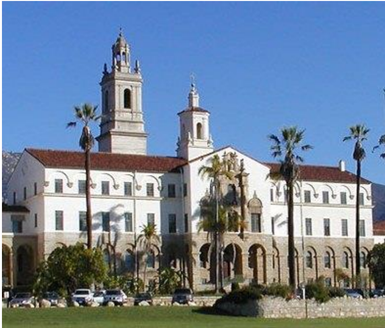
Saint Anthony Seminary, Santa Barbara