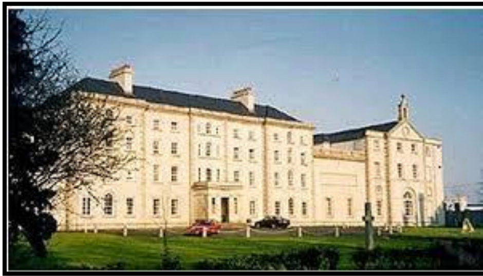
Photo taken from the St Patrick Seminary website