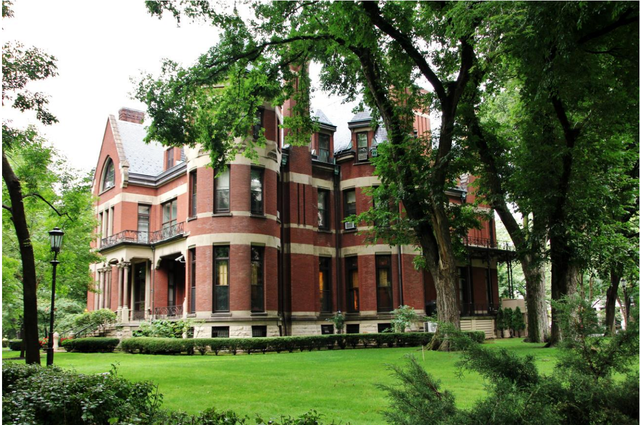
Residence of the Archbishop of Chicago