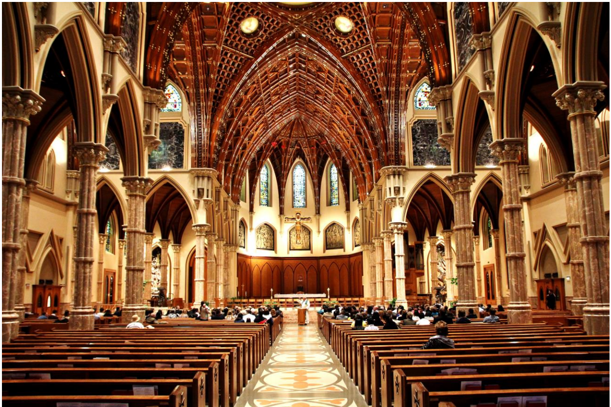
Interior of Holy Name Cathedral, Chicago