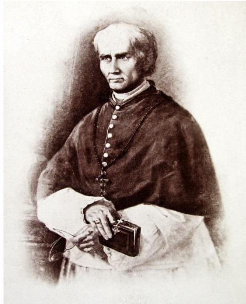
Bishop Joseph Sadoc Alemany

To understand more fully the character of those men, one must go back centuries to the Old World when Dominican houses were established. Both great and lowly entered those portals away from the sins and temptations of the world. Inside, they studied, prayed and worshiped God with true humility.