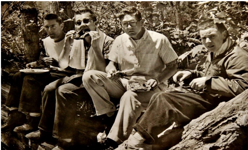
Saint Pius X Senior Class 1959