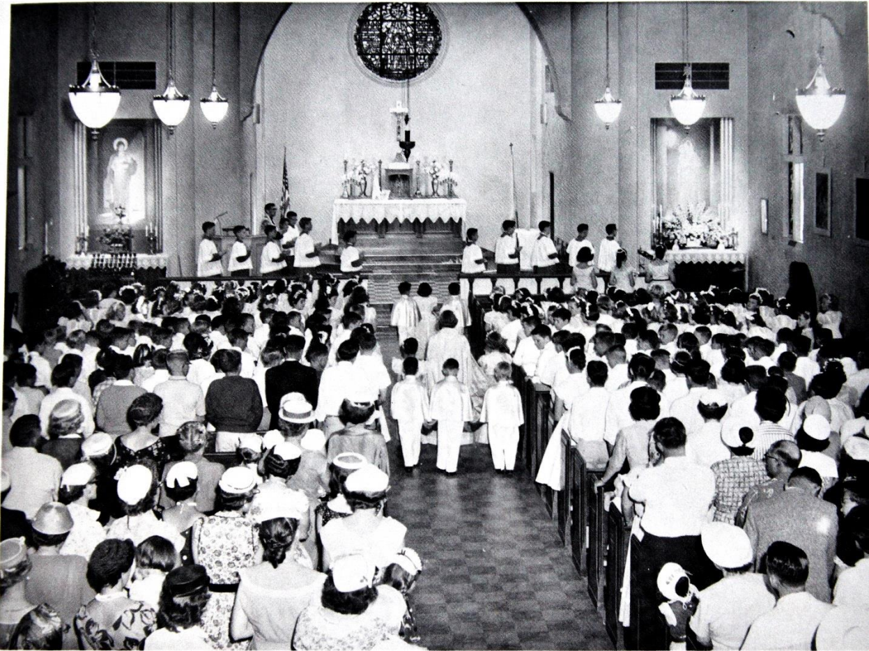
Holy Spirit Church — First May Crowning