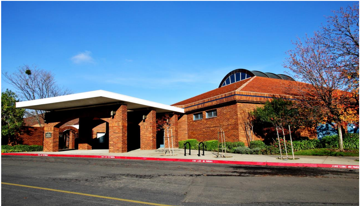
Second Church built across the Street from the First Church