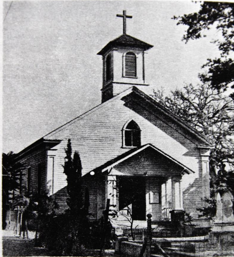
Original St. John the Baptist Church Folsom, built around 1857