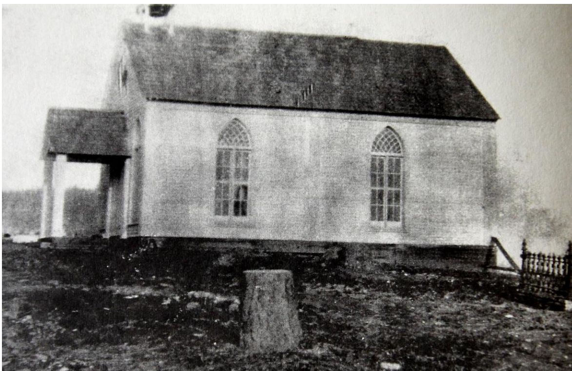
Saint Dominic Mission Church, Iowa Hill