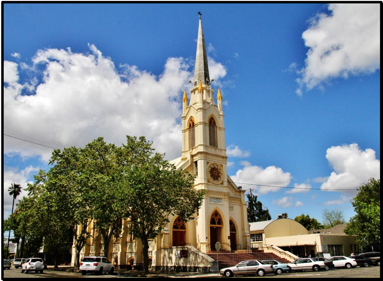
St Joseph Church, the First Cathedral of the Vicariate of Marysville