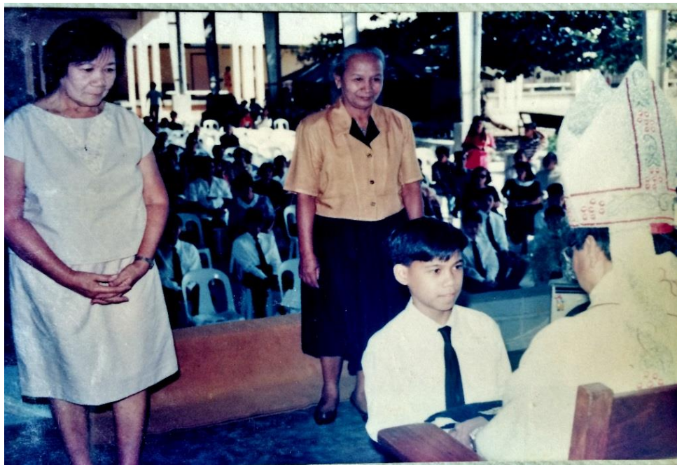
Rite of Investiture, Immaculate Conception Minor Seminary, Vigan City, Philippines