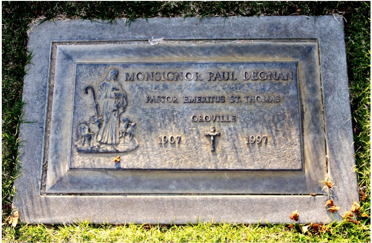
Monsignor Degnan's Grave Priests' Section, Calvary Cemetery, Sacramento