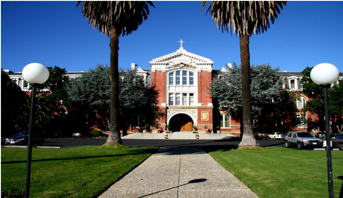
Saint Patrick Seminary, Menlo Park, CA