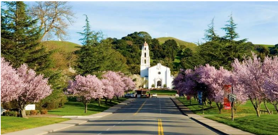
Saint Mary College, Moraga