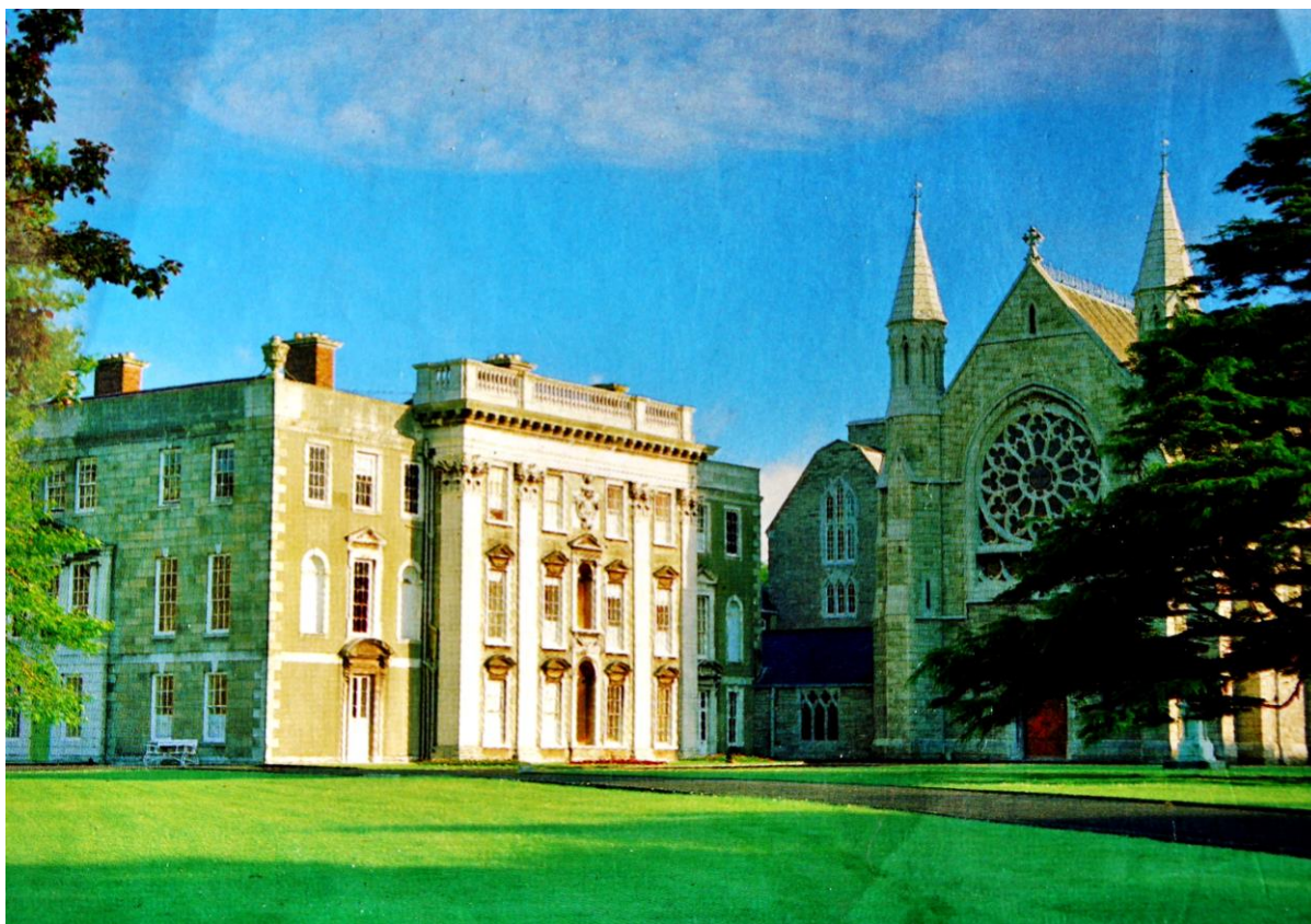
All Hallows College, Dublin, Ireland

This quotation from Sacred Scripture, Euntes, Docete Omnes Gentes , is written in stone over the lintel of Drumcondra House, Dublin, the main building of All Hallows College, and is the college motto. It means: Go, teach all nations .