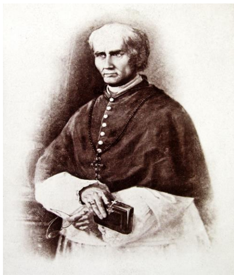
Archbishop Joseph Sadoc Alemany, OP Archbishop of San Francisco

service to the Church of California. For the rest of the century the majority of priests of San Francisco and Sacramento were from All Hallows. In this way California became one of the most concentrated mission fields of the College.