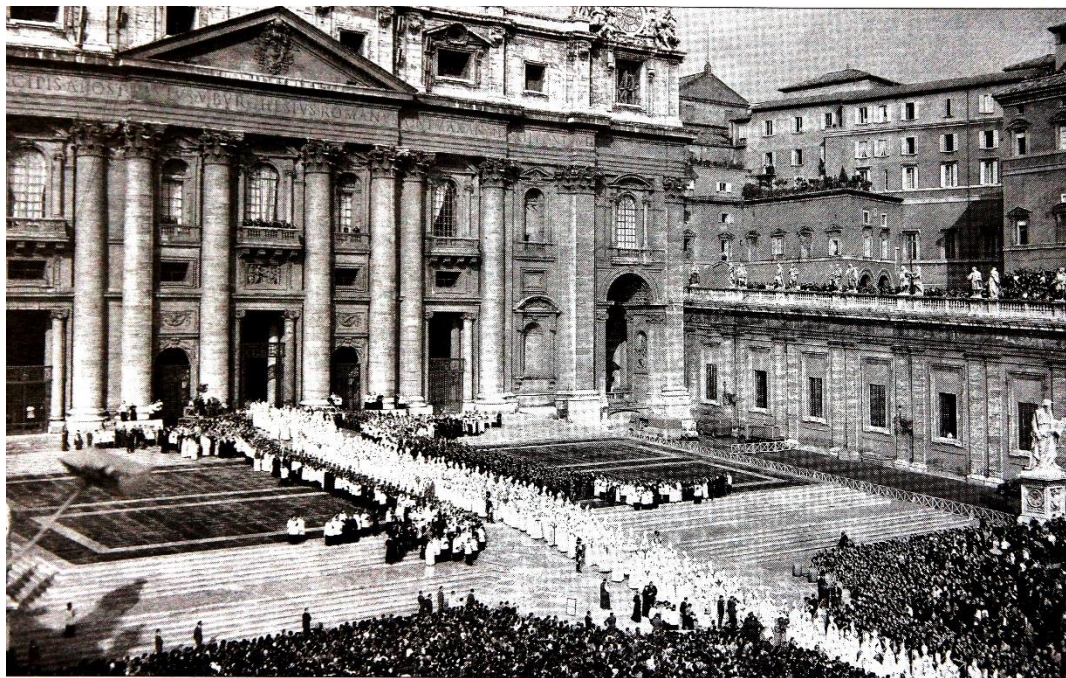
White-clad prelates walk into St. Peter's Basilica on Oct. 11, 1962, to open the Second Vatican Council.

This article was printed in the July 26, 1979 Retirement Special of the Catholic Herald