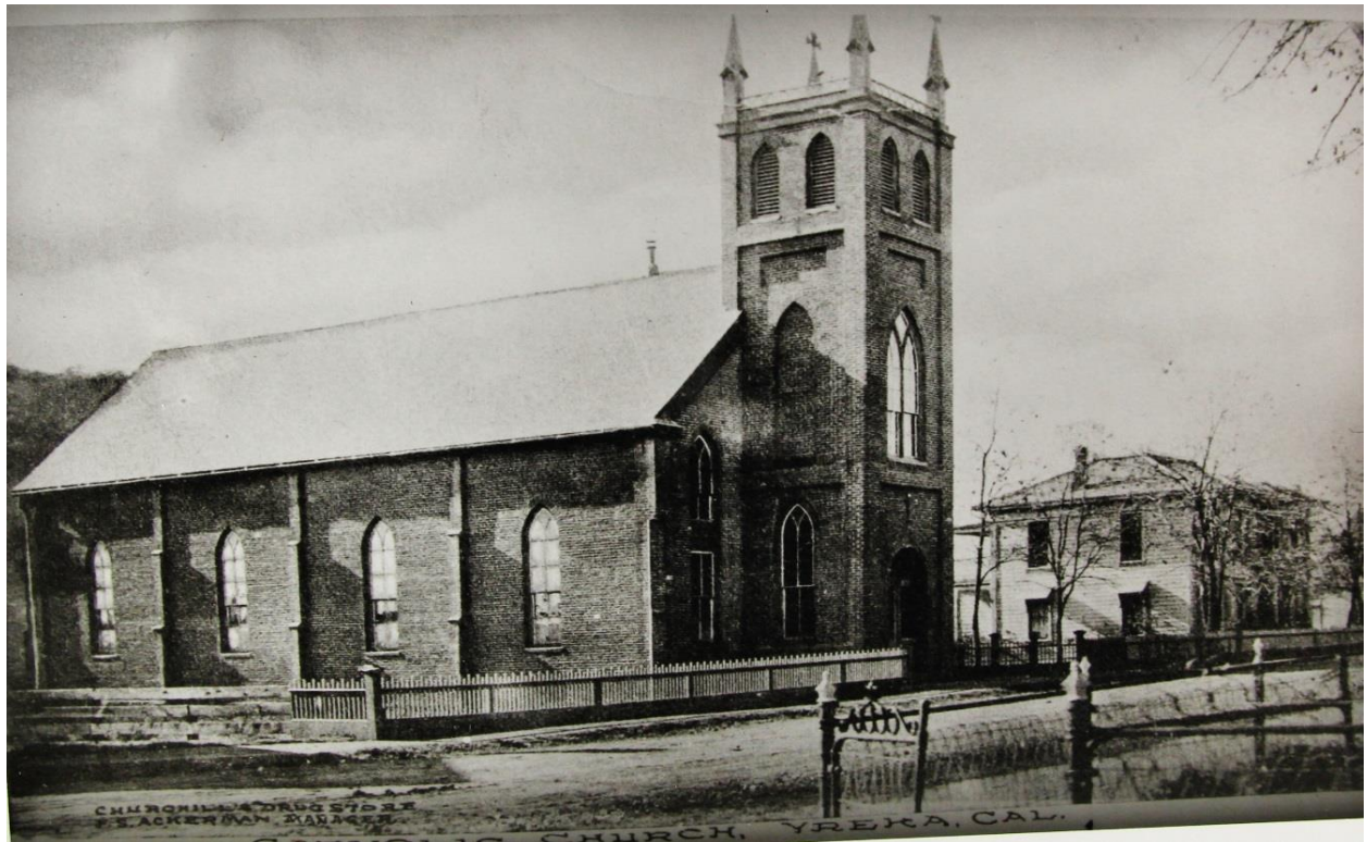
Saint Joseph Church in 1876