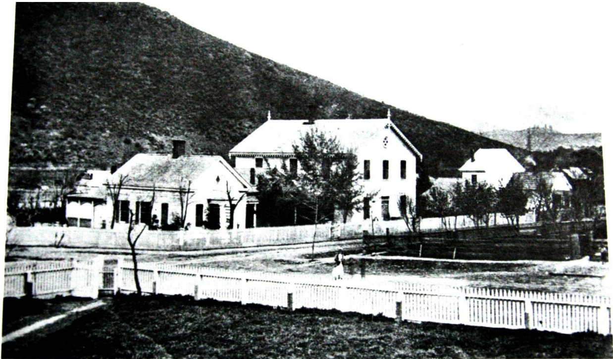
St. Joseph's Academy, Yreka, California

Four professed Sisters of Mercy with one novice and one postulant arrived in Yreka on February 2, 1871. By 1872, "Saint Joseph Academy for Young Ladies" was operating. The Academy began with five students but within a few years enrollment increased to 85 students.