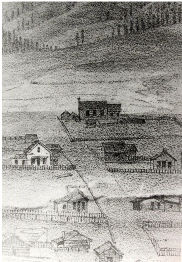
Drawing of the Temporary Church of 1854