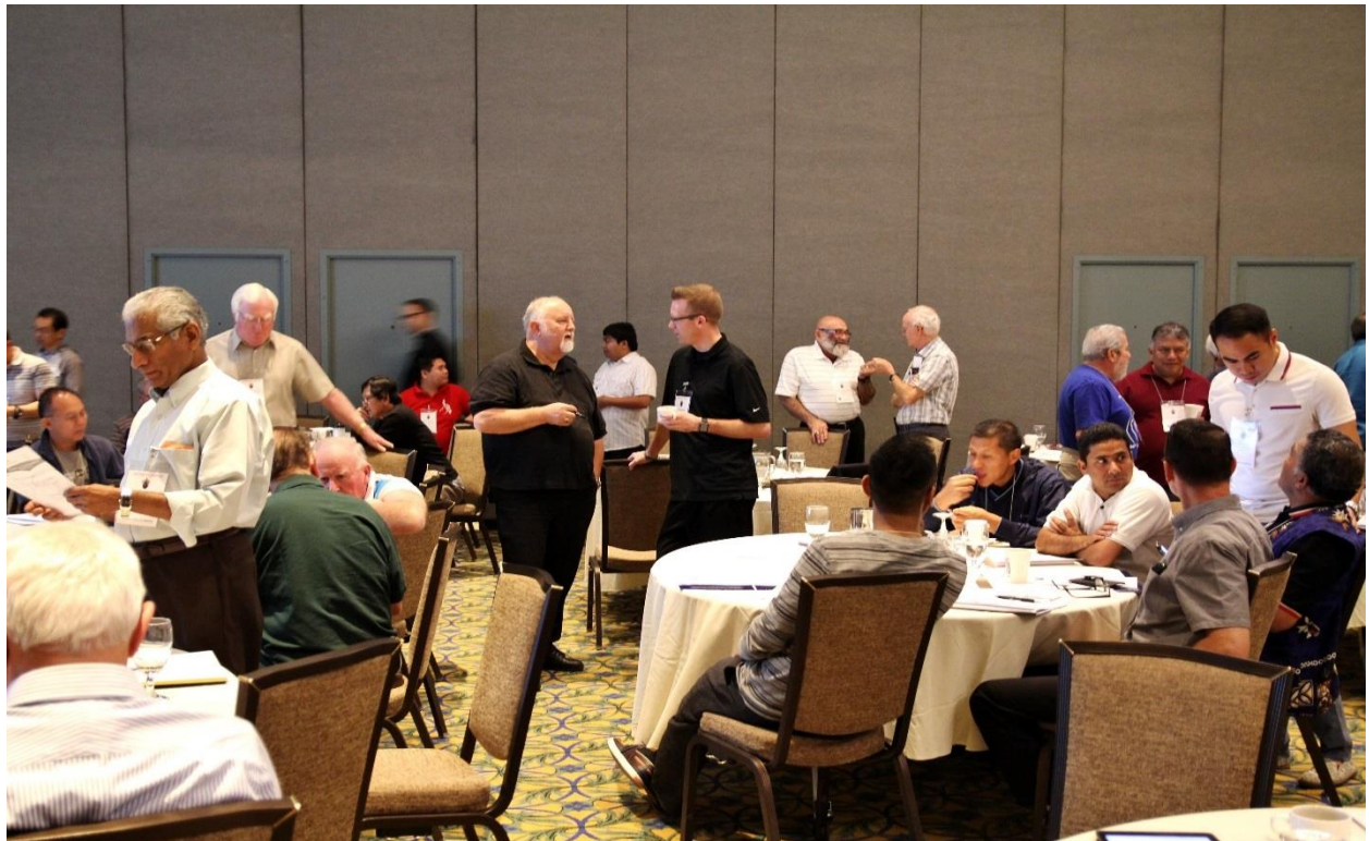
Waiting for the Session to Begin