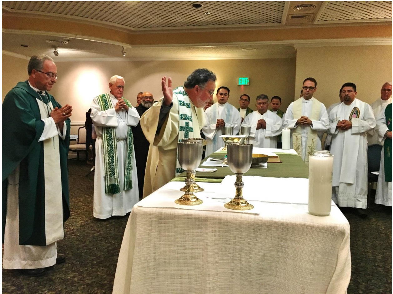
Bishop Myron Cotta Presided at Tuesday's Eucharist with Bishops Soto and Weigand