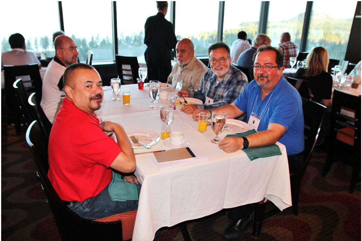
Breakfast on the 19 th floor Overlooking Lake Tahoe