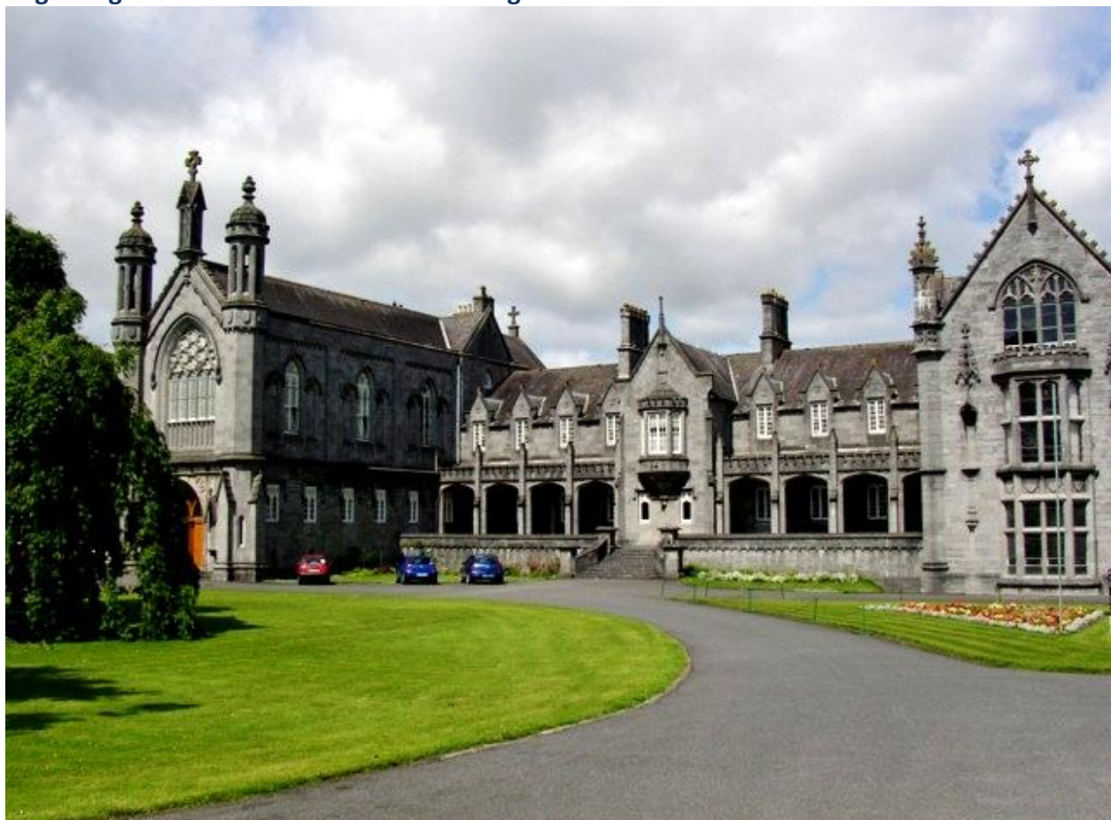
Saint Kieran's College, Kilkenny, Ireland