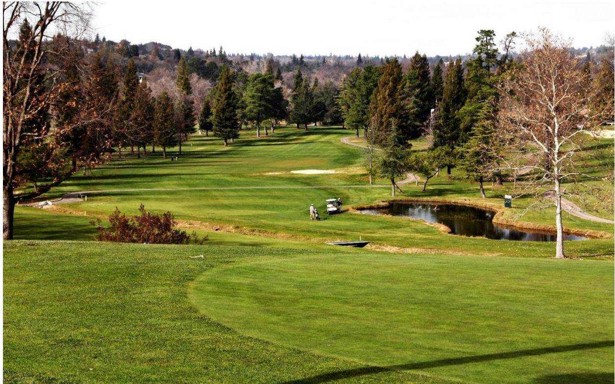
Cameron Park Golf Course and Country Club