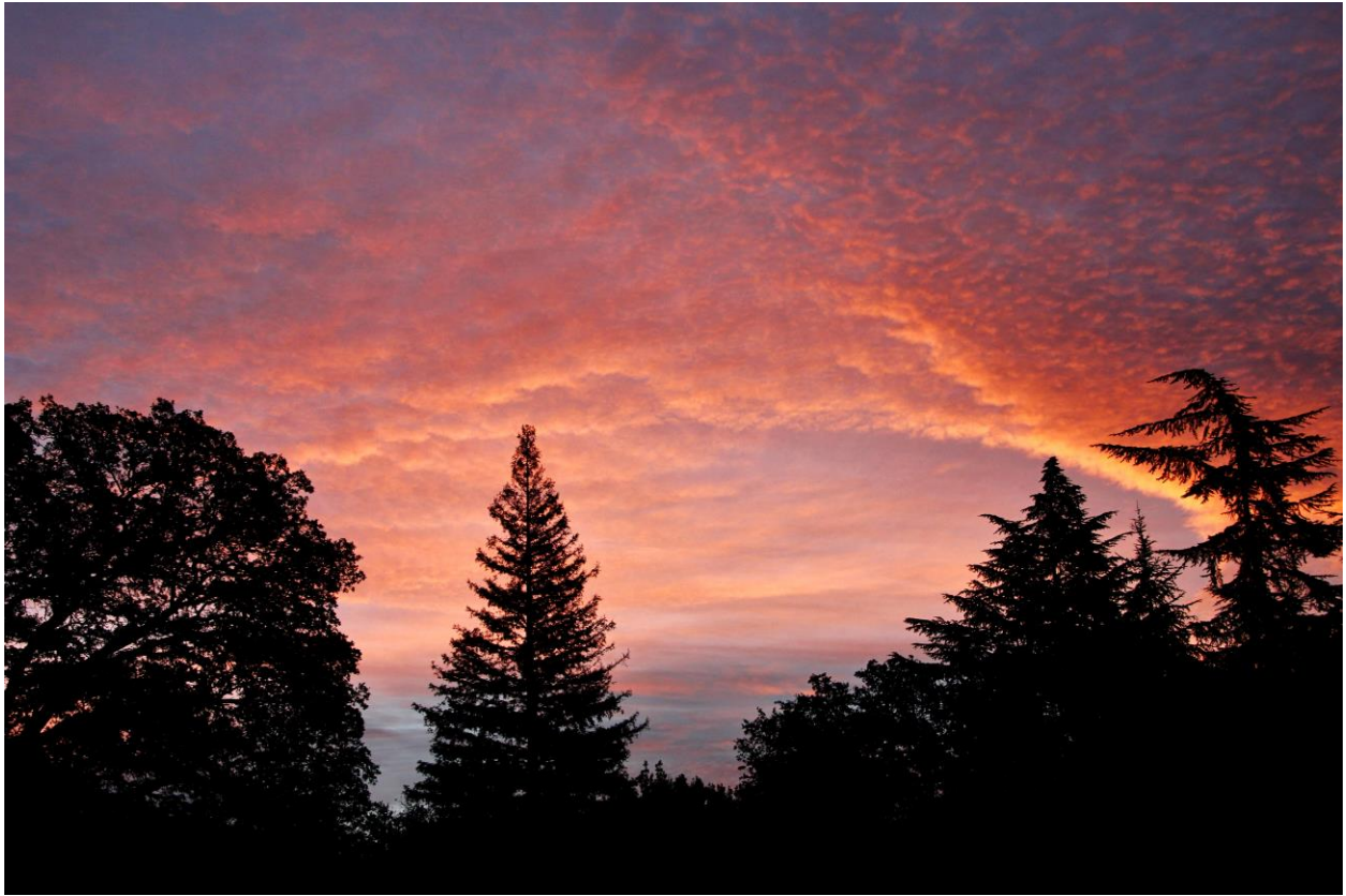
Sunrise at the Priests' Retirement Village October 2014