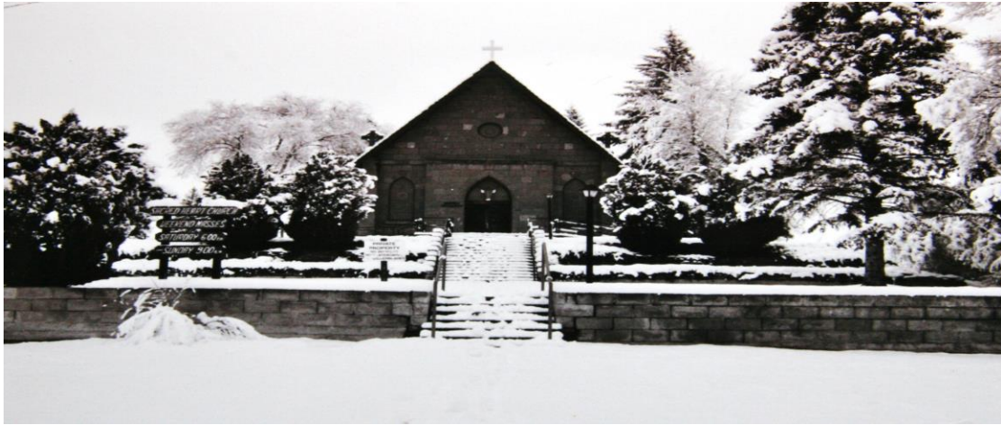
Sacred Heart Church, Alturas in Winter Time