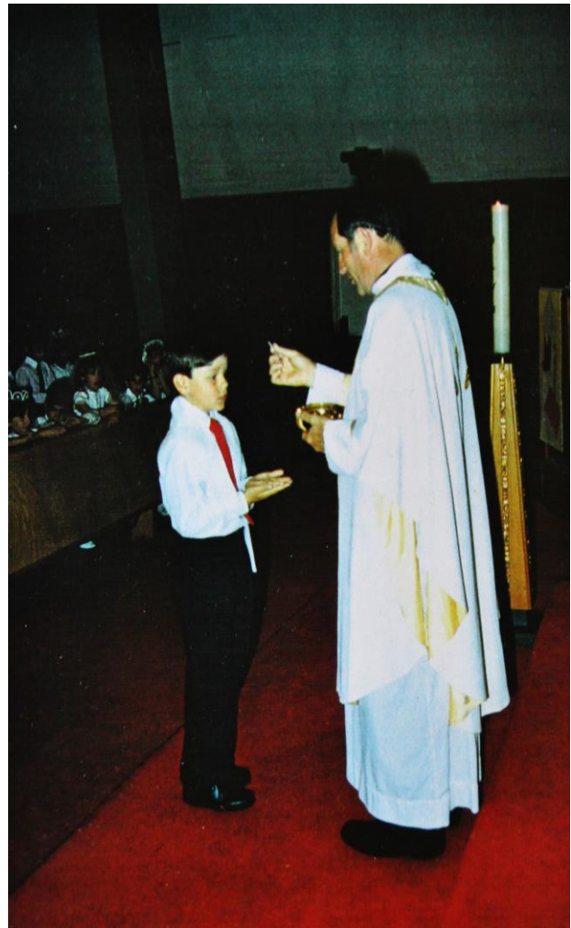
A First Communion in Folsom