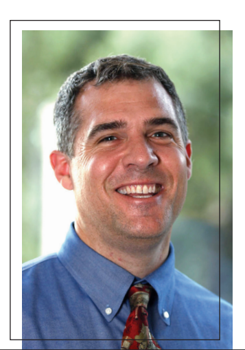
Office of Catholic Charities and Social Concerns