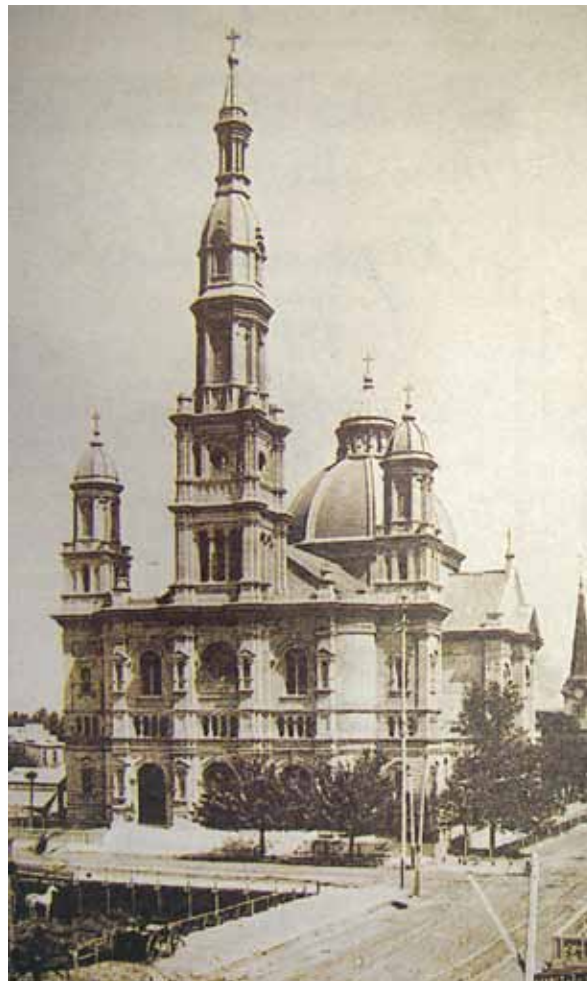
Cathedral of the Blessed Sacrament, 1899

us created these many wonderful Catholic institutions with the common desire of sharing Catholic life and giving witness to our Catholic faith in the broader community. ~ It is this same common desire which was the impetus for establishing The Catholic Foundation with the mission to “witness to Christ and His Gospel values of love, justice, forgiveness and service to all by ensuring the financial well-being of the Catholic works in our diocese.”